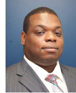
By Luther Thevenin, CPD